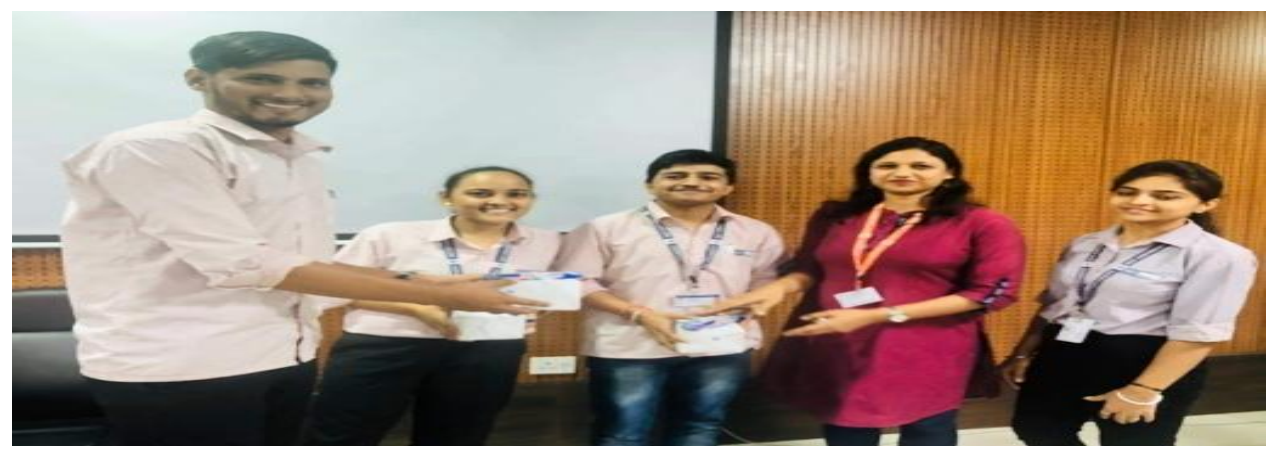
Group photo of participant and prize distribution