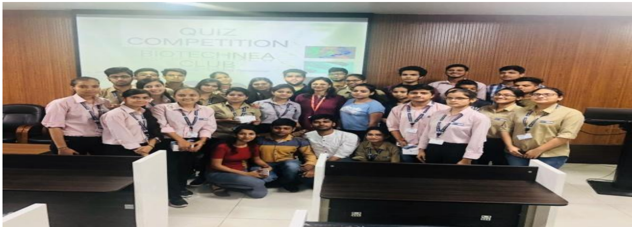
Group Photo of participant

The winning team was awarded with appreciation prizes and certification was provided to every team. As for future advancement in this activity we aim to make it more interdisciplinary and reach out more students not just from college but also from different universities. So, we can prepare and help our members to compete with all types of hurdles. About 30 student participated in the event.